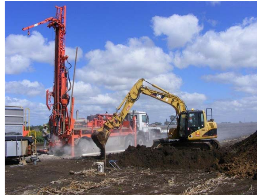
Exploration drilling on EPC 1149 Blackall